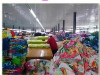
品检 product inspection