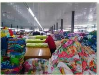
品检 product inspection