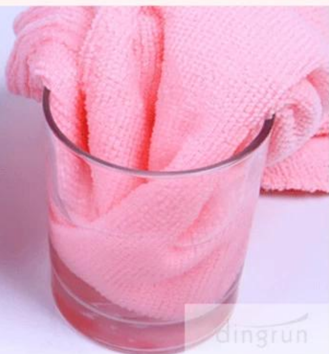
Left 1/3 glass of water