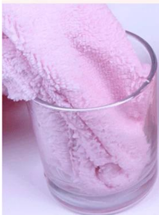
Almost left no water