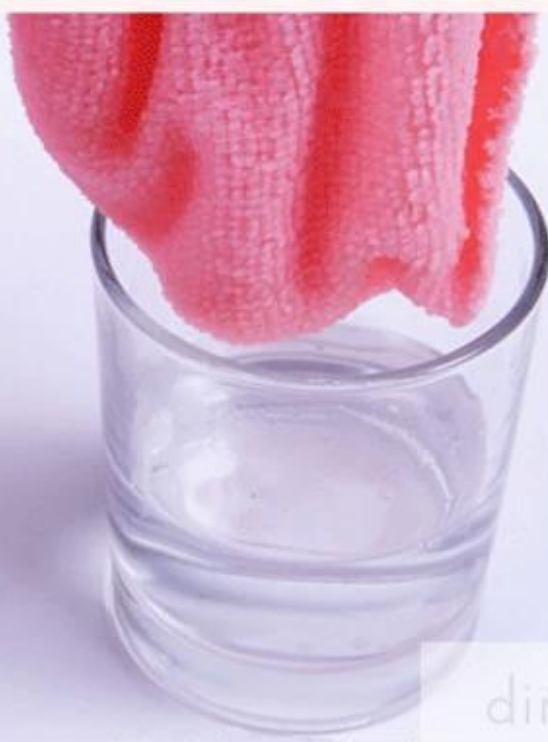
Relatively weak absorption