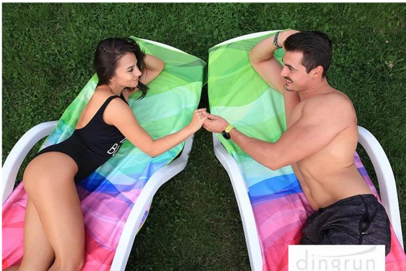
80x200cm / 300x300cm & 80x200cm / 300x300cm