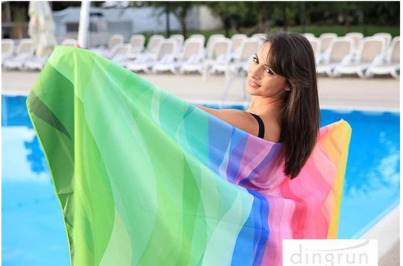
LARGE 彩虹色 ULTRA COMPACT & 超轻 - 沙滩巾 68x31" 折叠包装 200GSM 涤纶 彩虹色 沙滩巾、浴巾、毛巾、浴袍、浴帽、浴球、浴液、浴皂、浴液、浴皂、浴液、浴皂