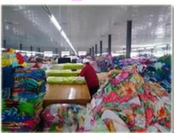
品检 product inspection