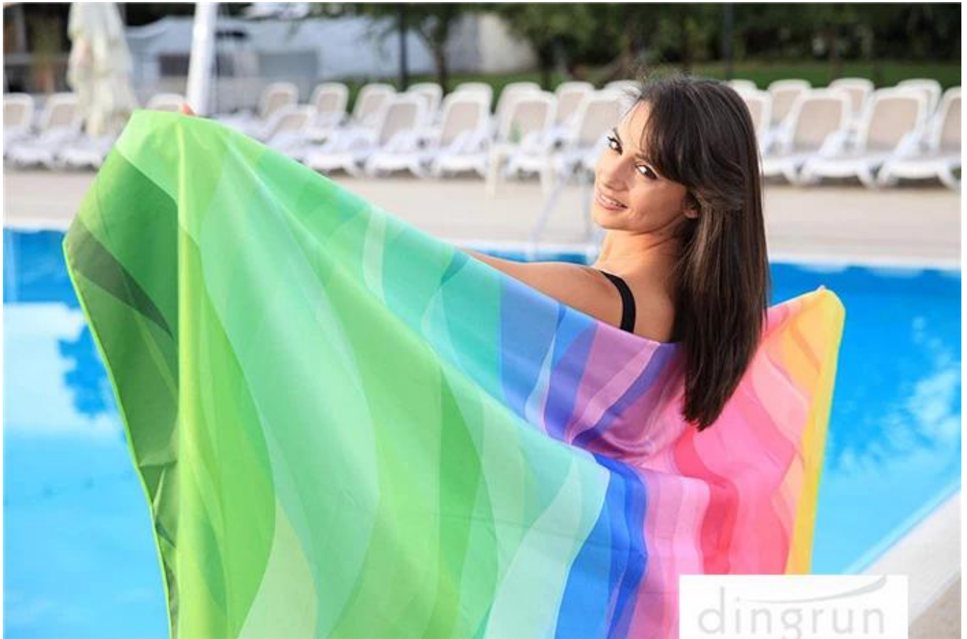
LARGE 彩虹色 ULTRA COMPACT & 超轻 - 沙滩巾 68x31" 折叠包装 涤纶 彩虹色 沙滩巾、浴巾、毛巾