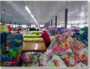
品检 product inspection