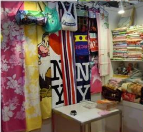
April 19-22, 2011 Hongkong Spring houseware Fair