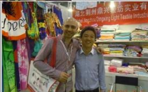
Oct20-23, 2012 Hongkong Autumn houseware Fair