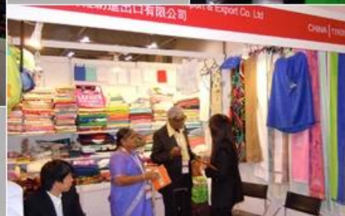
June 19-21, 2012 Miami Houseware Fair, USA