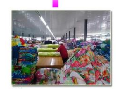
品检 product inspection