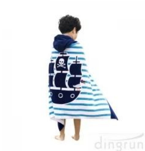
Hooded poncho towel