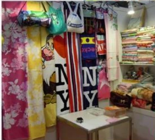
April 19-22,2011 Hongkong Spring houseware Fair