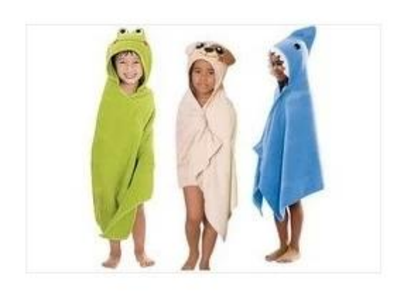
hooded baby towel