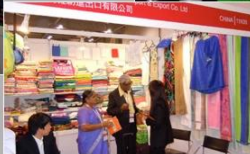
June 19-21, 2012 Miami Houseware Fair, USA