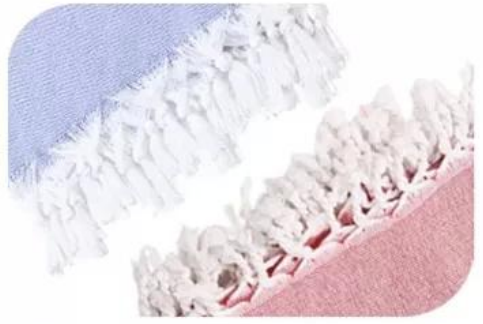
Eco-friendly color woven recyclable cotton, non-fading

Comfortable and soft, absorbent, Non-stick sand