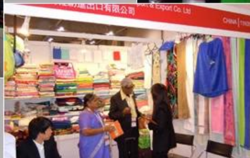
June 19-21, 2012 Miami Houseware Fair, USA