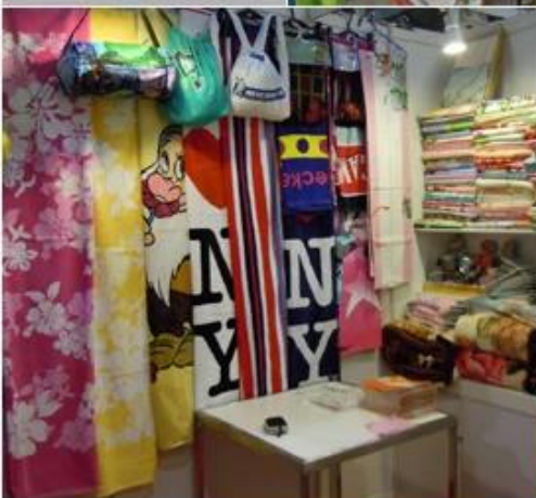
April 19-22, 2011 Hongkong Spring houseware Fair