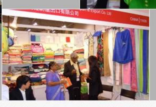
June19-21, 2012 Miami Houseware Fair USA