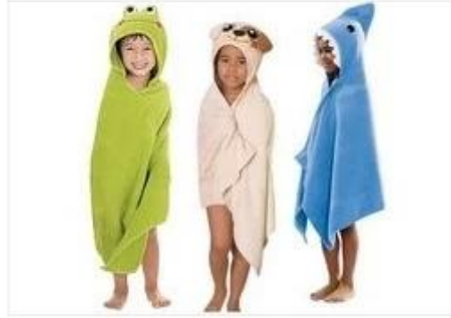
baby towel with hood