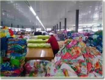
品检 product inspection