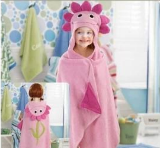
hooded beach towel manufacturers for children