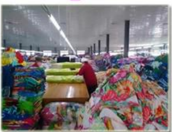
品检 product inspection