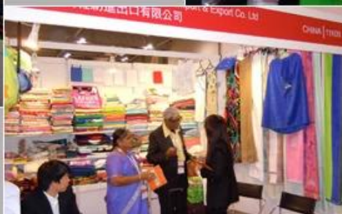
June 19-21, 2012 Miami Houseware Fair, USA