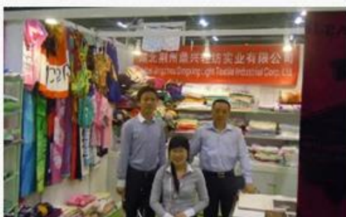
June 19-21, 2013 Miami Houseware Fair, USA