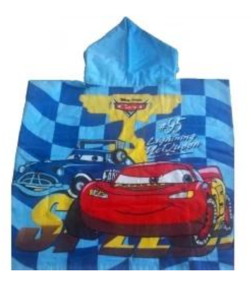
manufacturers of hooded beach towels for children