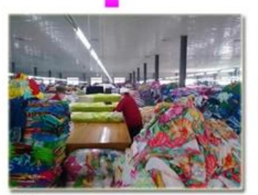
品检 product inspection