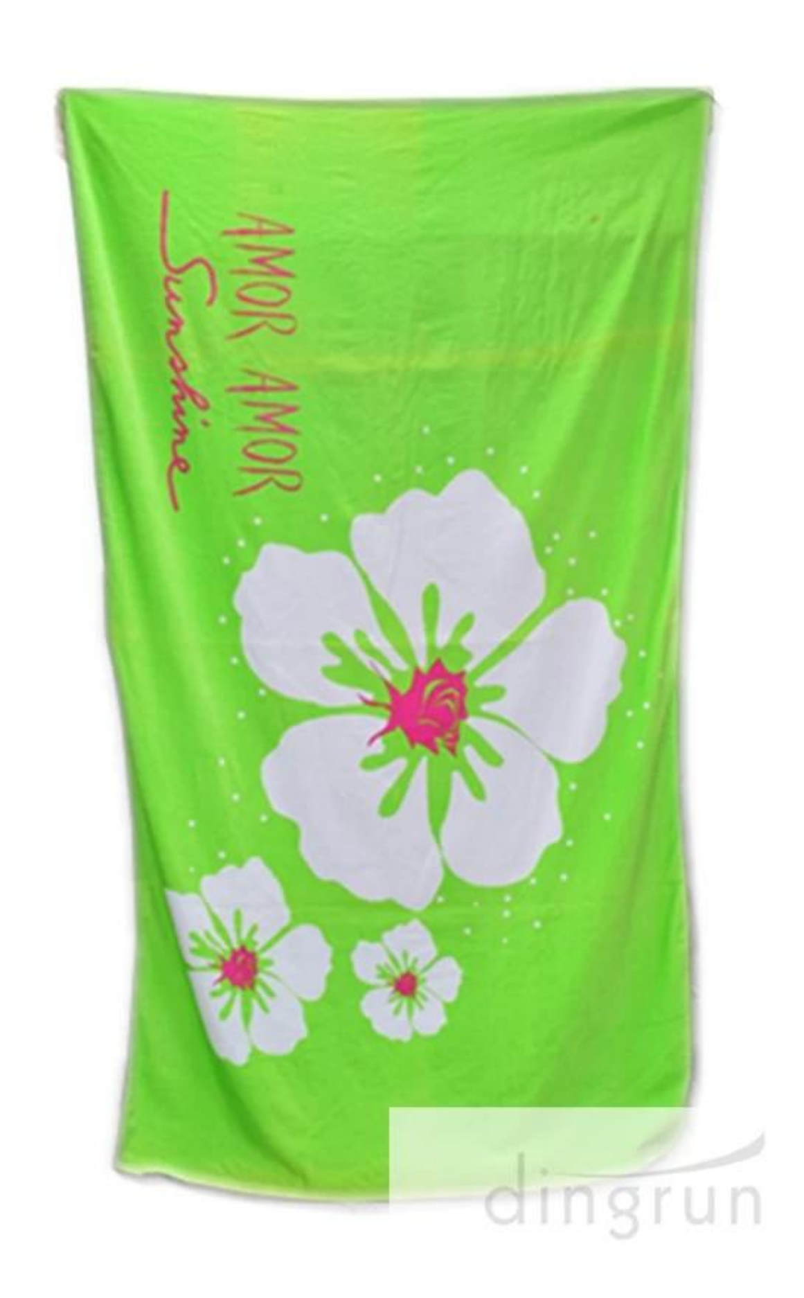
The 28" X 54" Beach Towel perfect for soaking up the rays on your next visit to the pool or a