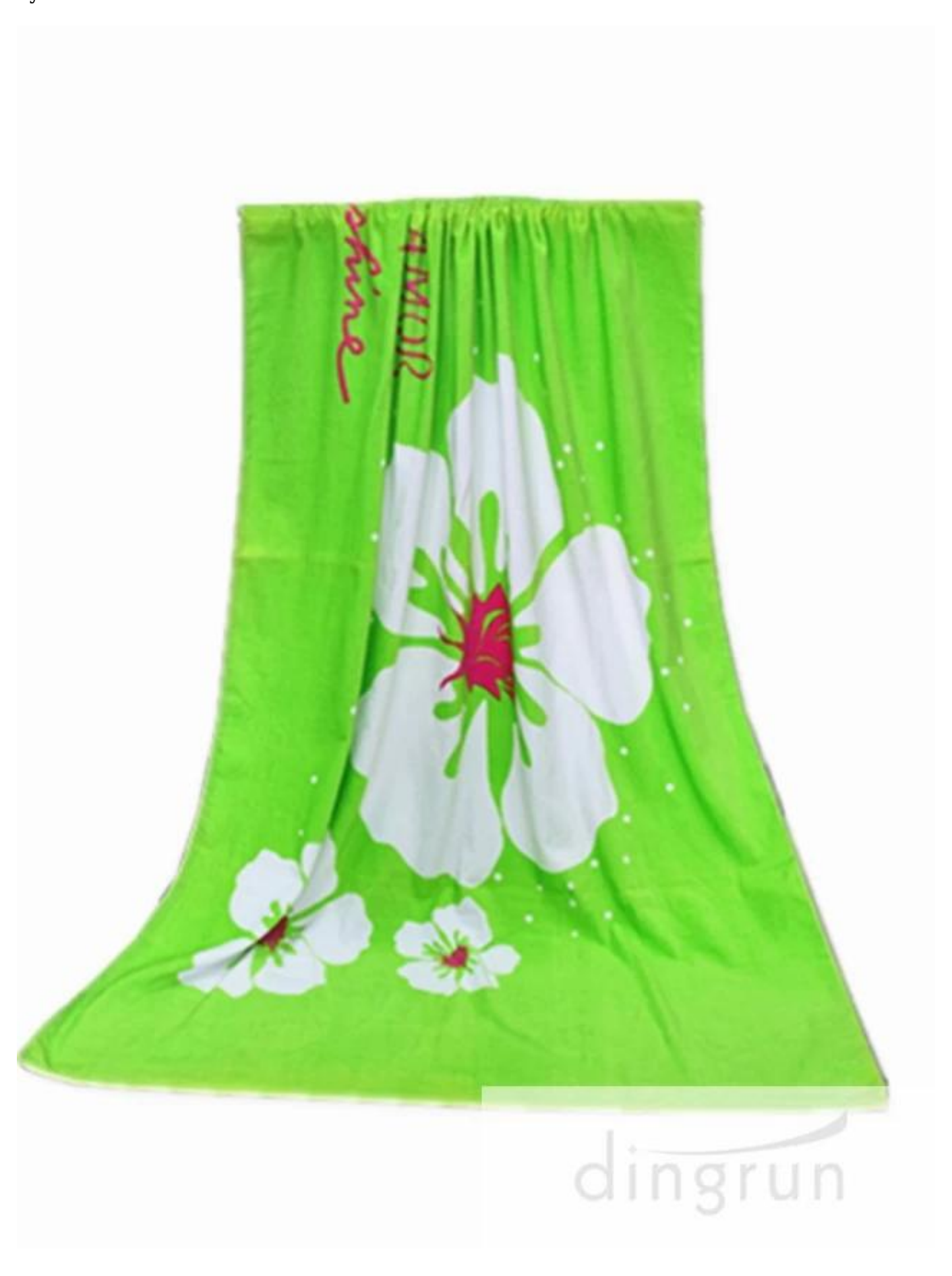
Light weight and durable, this towel is great for toting to your day at the beach.