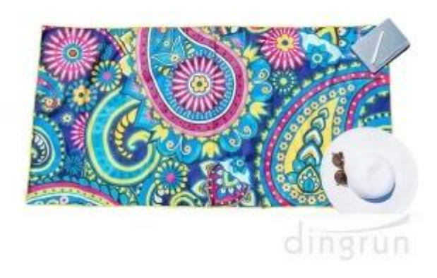
microfibre beach towel factory