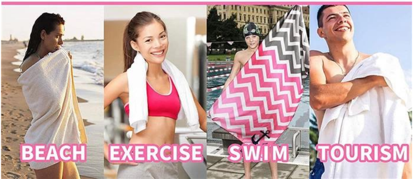
MULTI-PURPOSE: Not just a gorgeous bath towel or beach blanket! Use it for park picnics, yoga & meditation & poolside lounging.