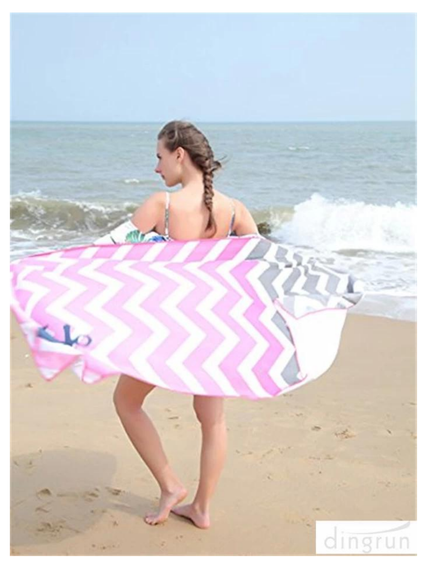
The large size 31.5 "x 63" lets you wrap warmly after a swim and the colorfast material means that the colors of this towel will not fade.