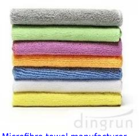
Microfibre towel manufacturer