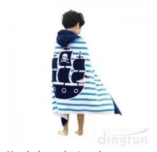
Hooded poncho towel