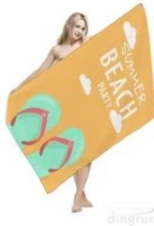
Microfiber beach towel