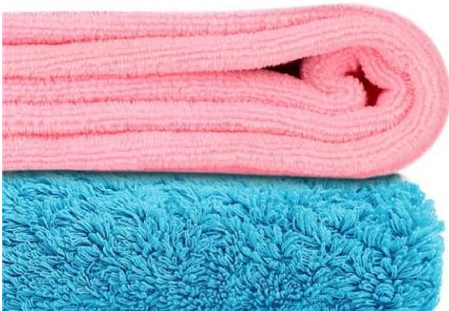
OUR PREMIUM TOWELS