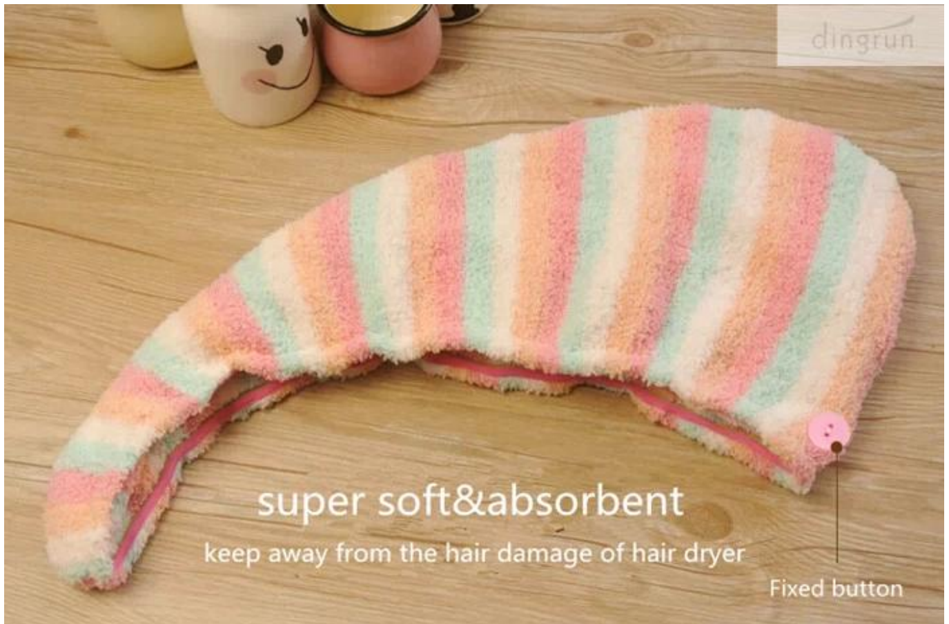
One Size Fits Most - For Hair Lengths Up to 14" - It's Vegan & Earth Friendly!