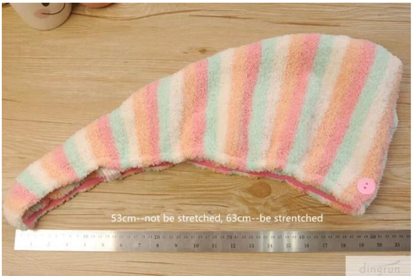
This microfiber hair towel Has a Uniquely Shaped Design Which Includes An Adjustable Headband. The microfiber hair towel doesn't require a ton of manipulation and maneuvering