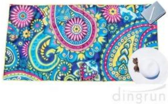
microfibre beach towel factory