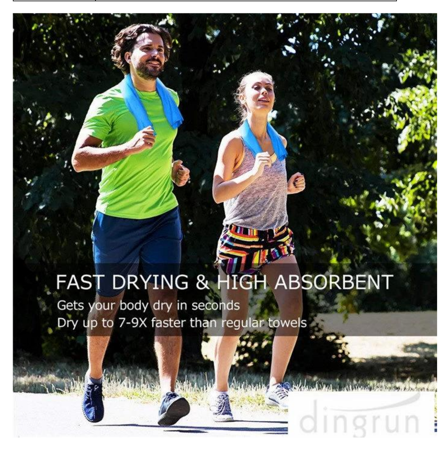
High Quality Microfiber—beach towel is made of high quality which touches soft, smooth. It is very friendly to your skin.