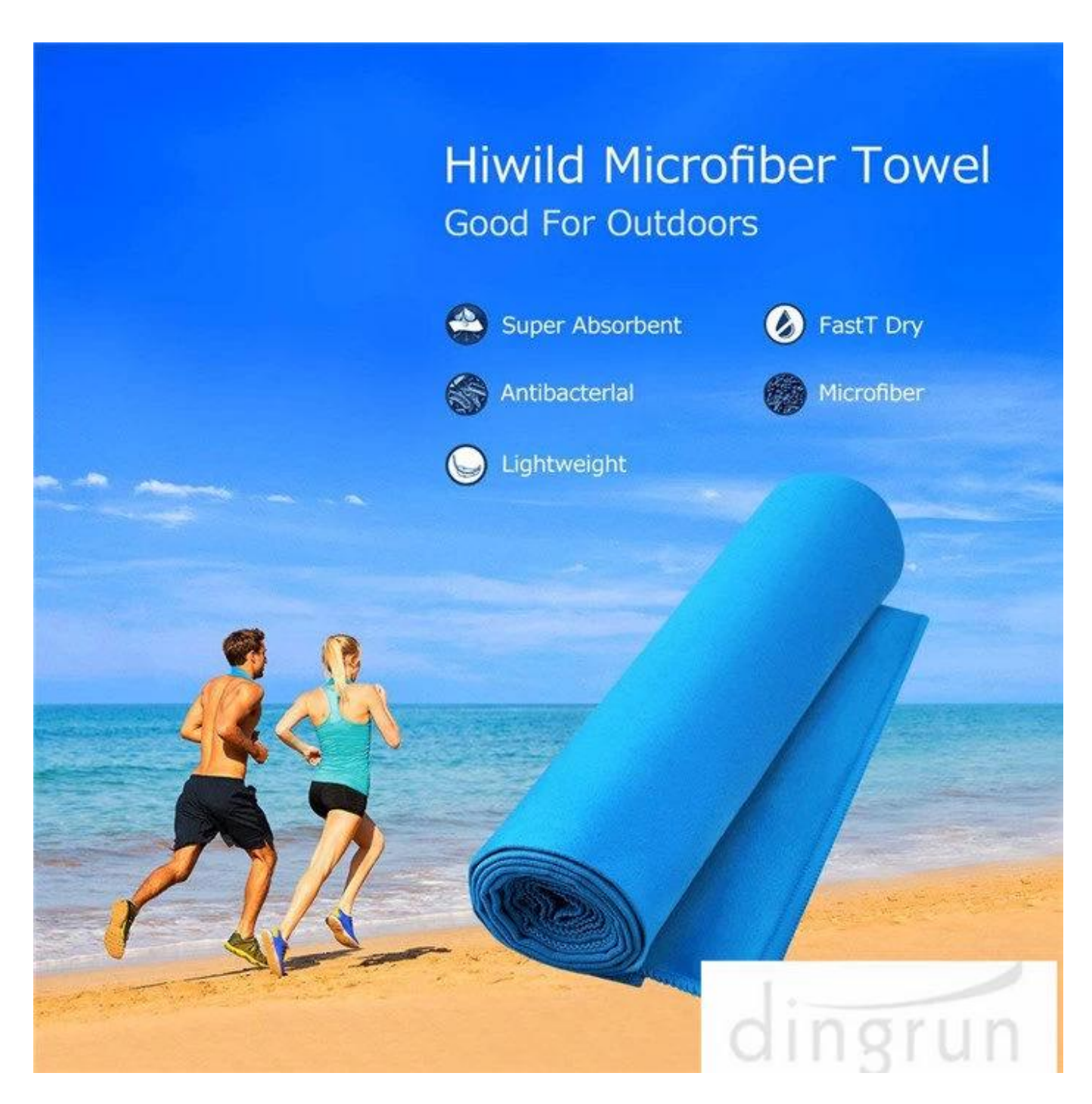
Fast Dry, Sand Free— hiwild beach microfiber towel dries 3 times faster than a normal cotton towel. When it is dry, just shake the towel and all the sand will fall.