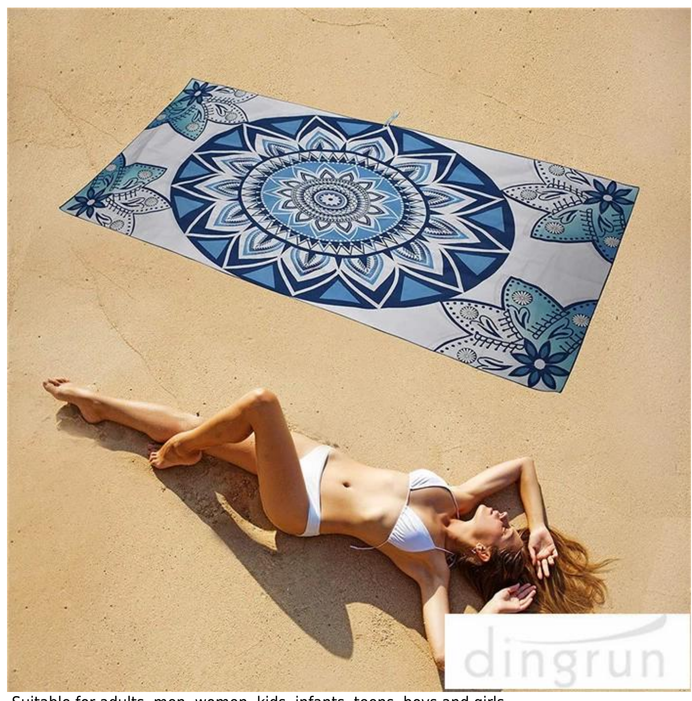
Suitable for adults, men, women, kids, infants, teens, boys and girls.