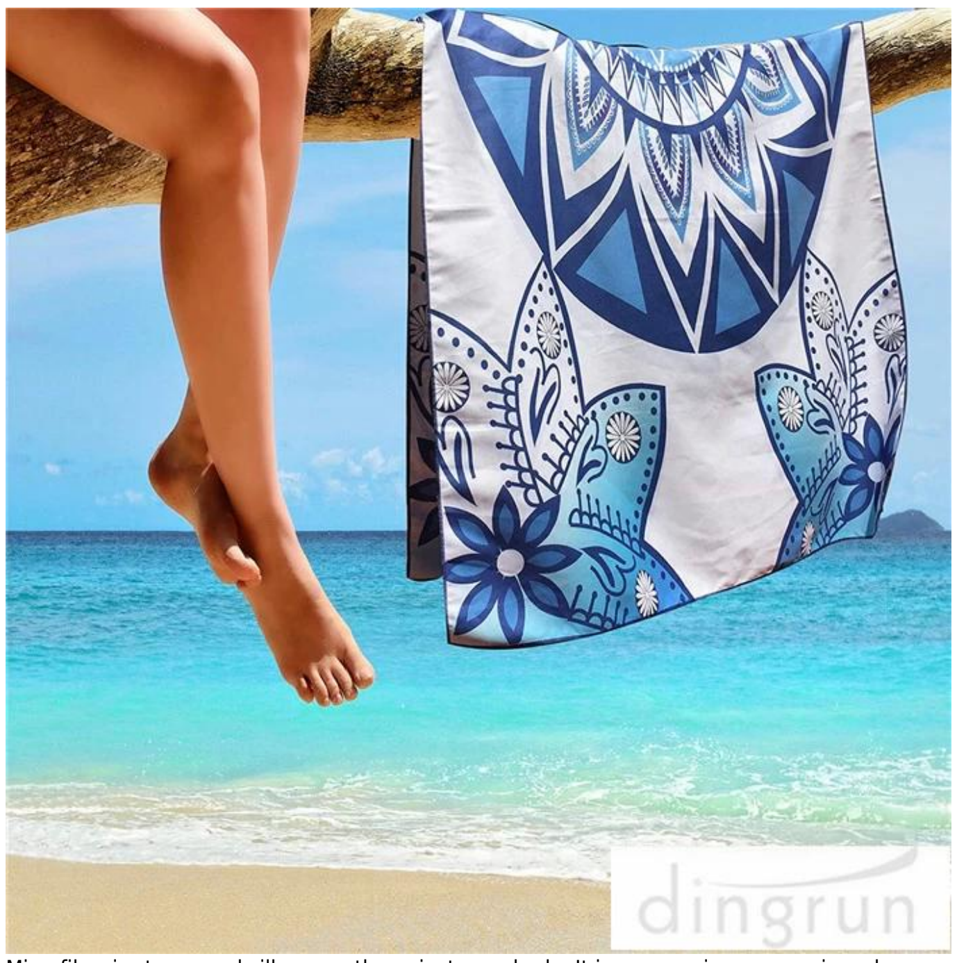
Microfibre is strong and silky smooth against your body. It is an amazing companion when you do Yoga or Pilates. It is a great beach accessory for adults, outdoor recreation, hiking and it saves a lot of space in your baggage.