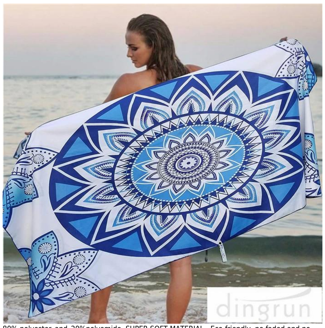
80% polyester and 20%polyamide, SUPER SOFT MATERIAL - Eco-friendly, no faded and no smell.