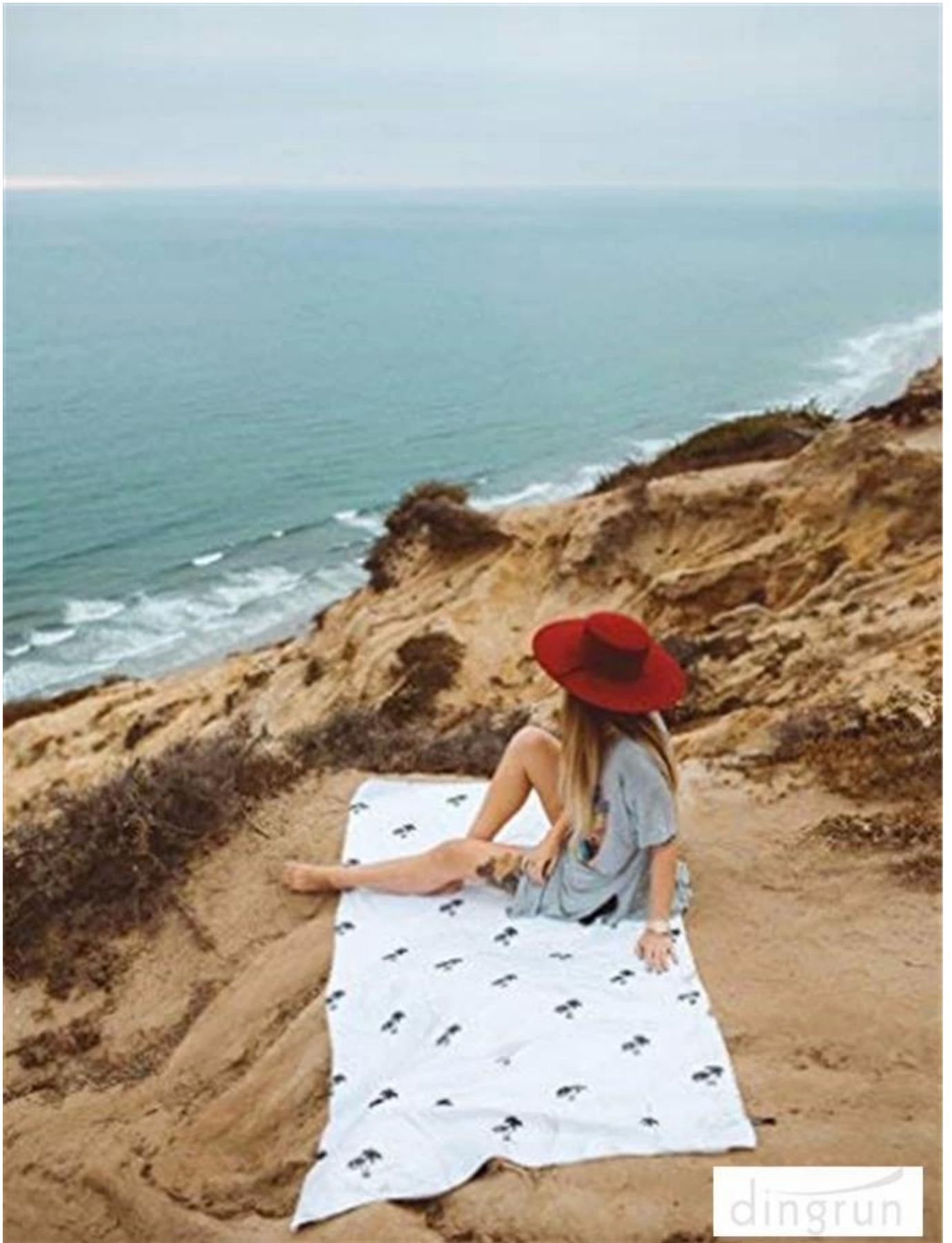
FRIENDLY FOR/AS: Beach Travel, Beach Towel, Beach blanket, Bath Towels, Picnic Blanket, Camping