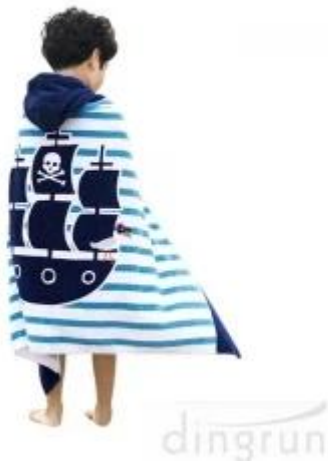
Kids Hooded poncho towel