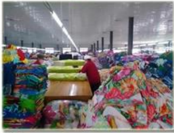
品检 product inspection