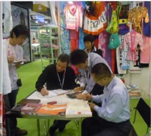
April 19-22, 2011 Hongkong Spring houseware Fair