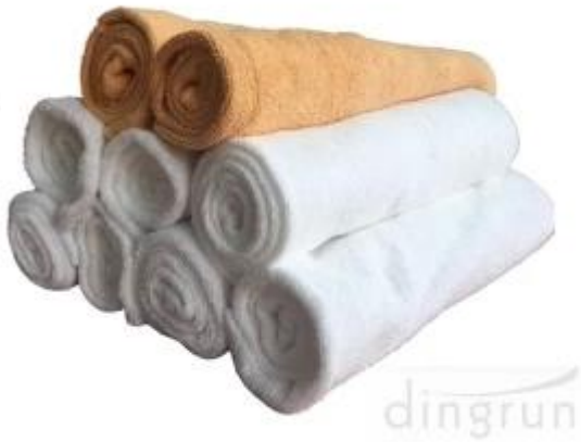
Manufacturer of cleaning towels