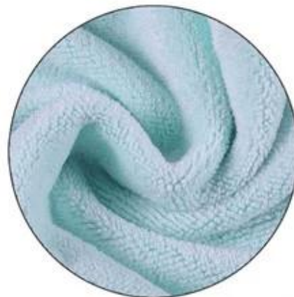
Microfiber Material Soft & Comfortable

Protect your hair: We both know that hair becomes brittle when using the hair dryer for a long time. Because heat causes damage. So use our hair towels that reduce frizz and split ends. The important thing is that you do not have to spend a lot of time under the hair dryer. And it does not have the feeling of a heavy towel. It is suitable for all types of hair. Like thin, medium, thick, curly, long and rough hair. Protect your hair: We both know that hair becomes brittle when using the hair dryer for a long time. Because heat causes damage. So use our hair towels that reduce frizz and split ends. The important thing is that you do not have to spend a lot of time under the hair dryer. And it does not have the feeling of a heavy towel. It is suitable for all types of hair. Like thin, medium, thick, curly, long and rough hair