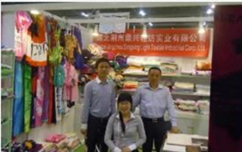
June 19-21, 2013 Miami Houseware Fair, USA