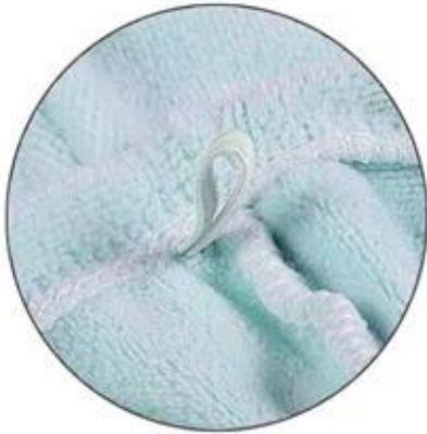
Elastic band, Easy to use