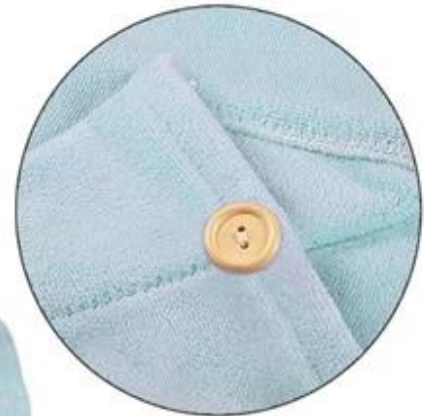
Wooden button. Simple & Strong