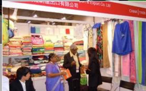
June 19-21, 2012 Miami Houseware Fair, USA