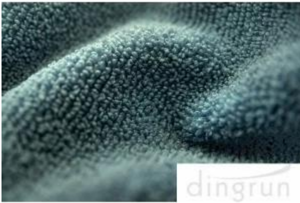
Cleaning Towel manufacturer