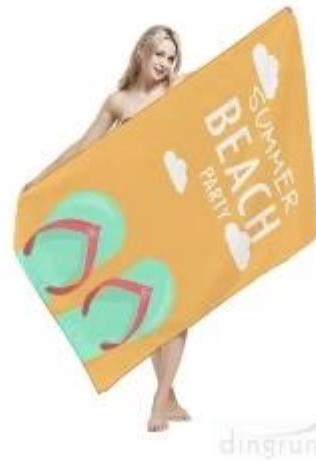
Microfiber beach towel

If you are interested in our products, please feel free to contact us!!