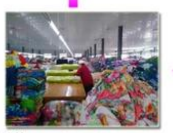
品检 product inspection