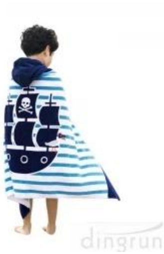
Asciugamano poncho con cappuccio asciugamani da bagno