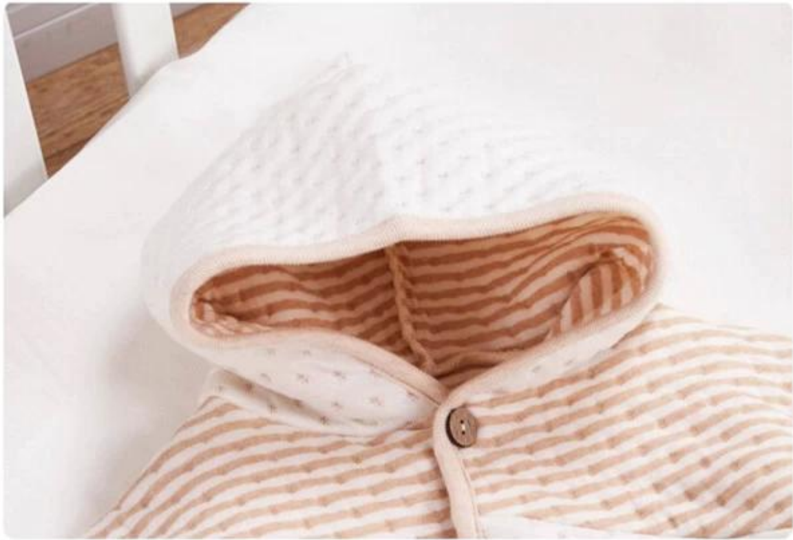
A hat--comfortable and warm