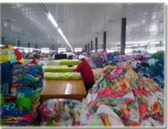
品检 product inspection