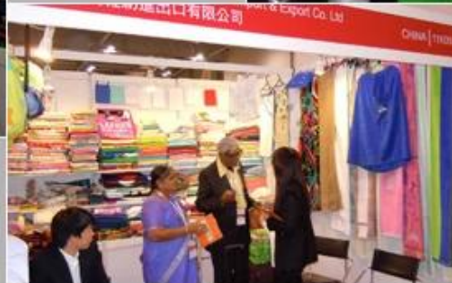
June 19-21, 2012 Miami Houseware Fair, USA