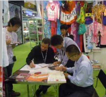
April 19-22, 2011 Hongkong Spring houseware Fair