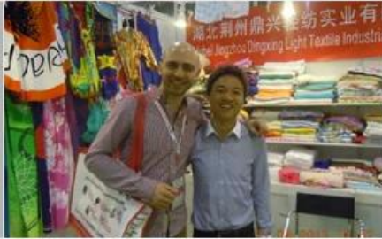
Oct 20-23, 2012 Hongkong Autumn houseware Fair