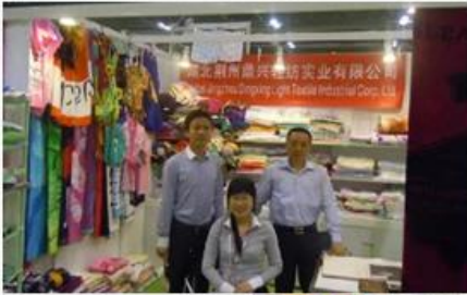
June 19-21, 2013 Miami Houseware Fair, USA