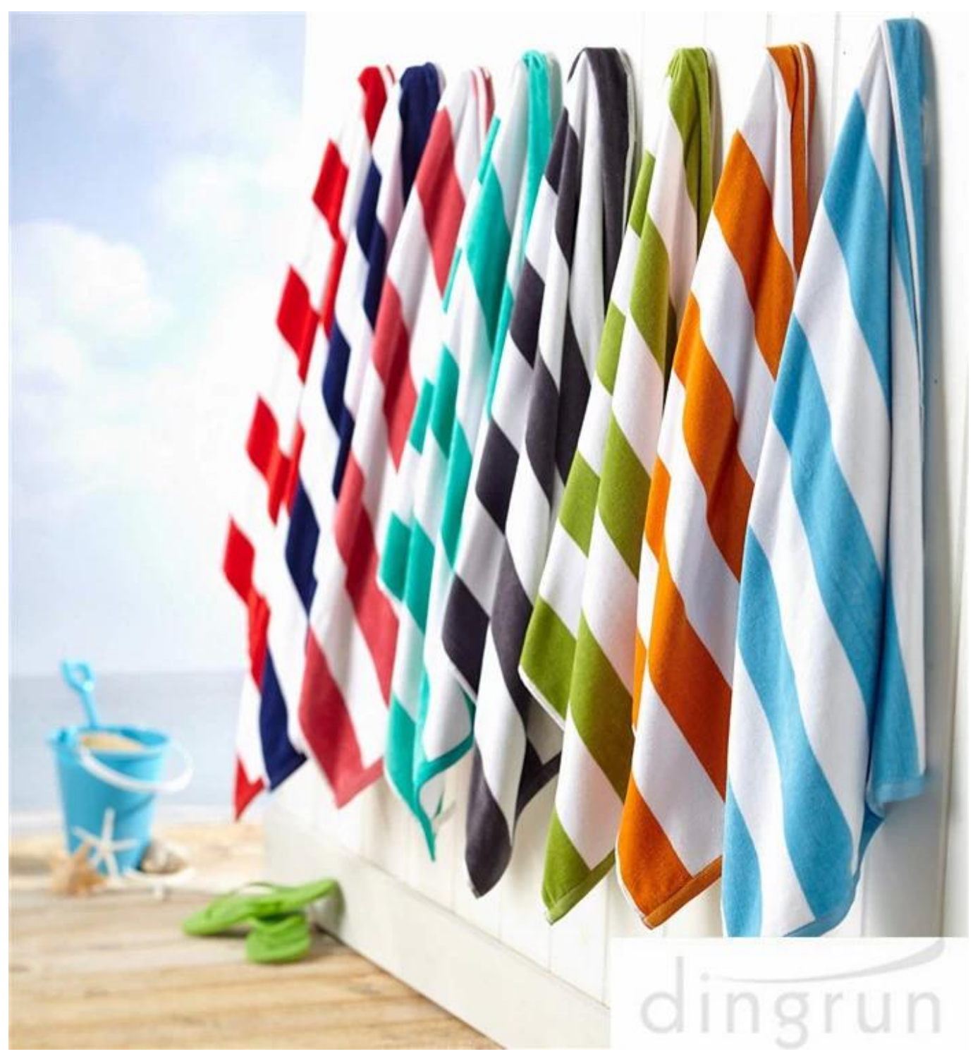
Made of 100% genuine cotton for supreme comfort and luxury - Eco-friendly, no faded and no smell.