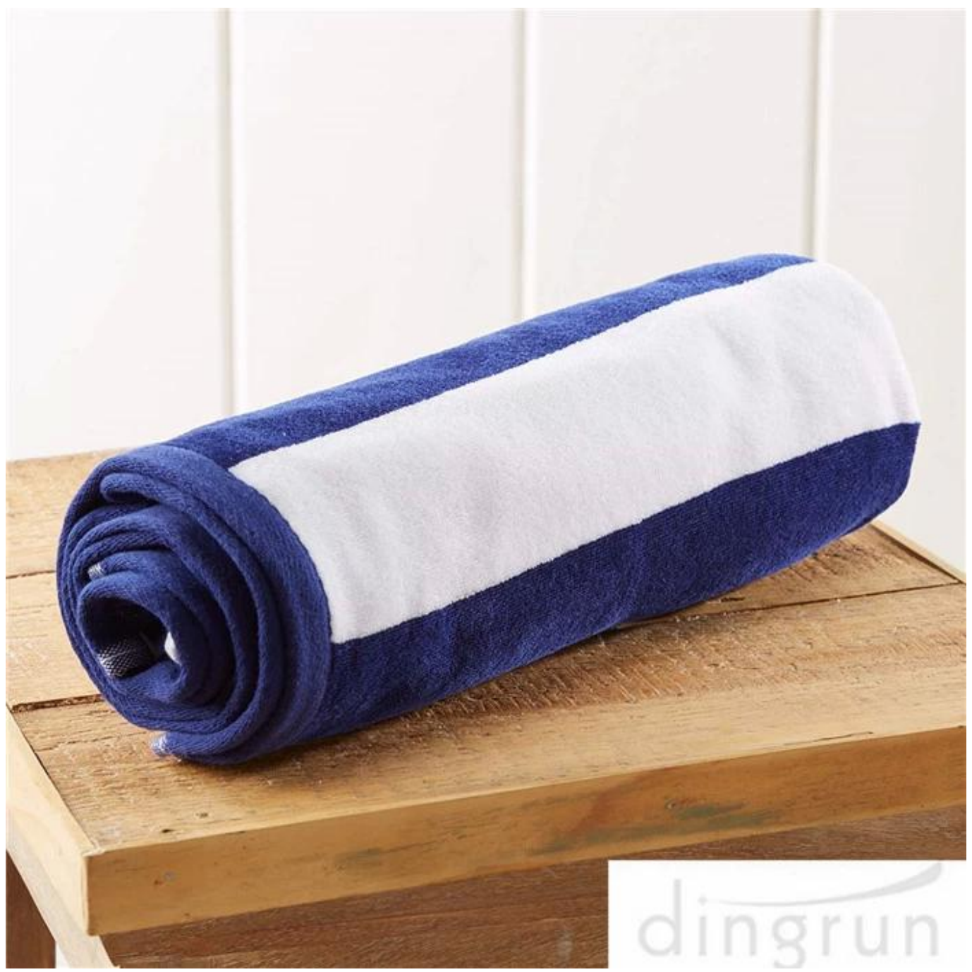
Soft, absorbent, and attractively designed, these extra-big velour beach towels feel great after a hot shower or when coming out of the surf. Their classic style and bright colors make them perfect for the whole family. They also make great gifts for weddings, birthdays, and other celebrations.