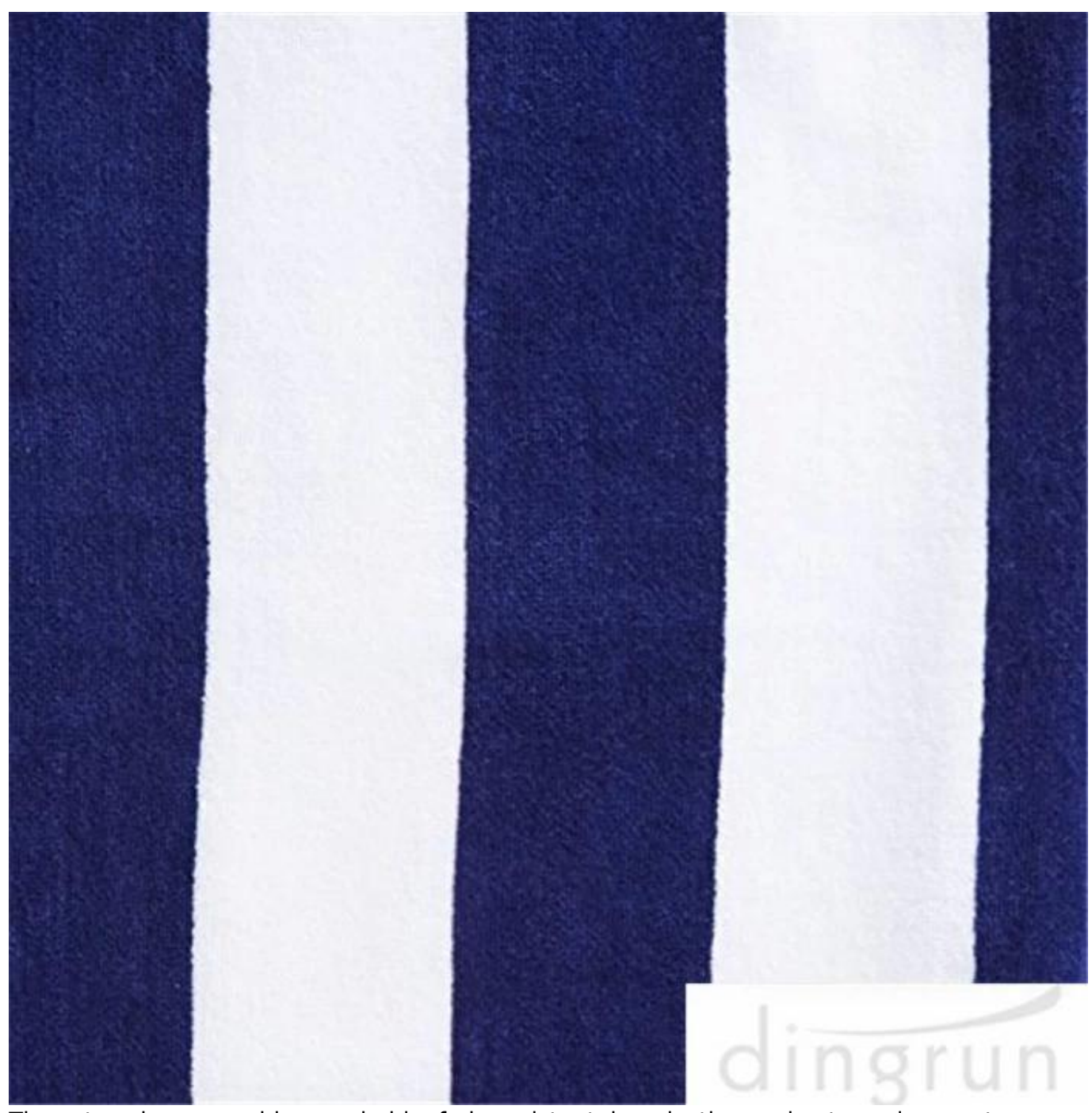
These towels are machine washable, fade resistant, long lasting and extremely easy to care for.