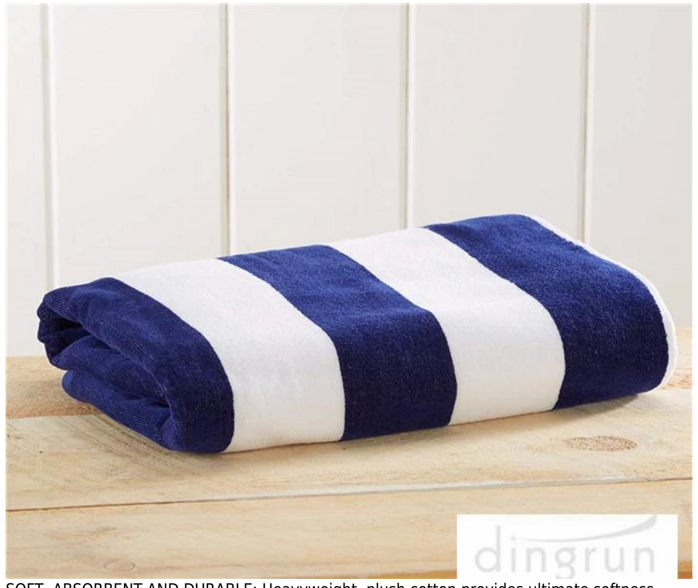
SOFT, ABSORBENT AND DURABLE: Heavyweight, plush cotton provides ultimate softness, absorbency and durability.