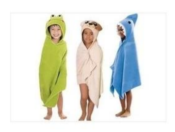
hooded baby towel