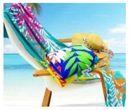
beach towel manufacture