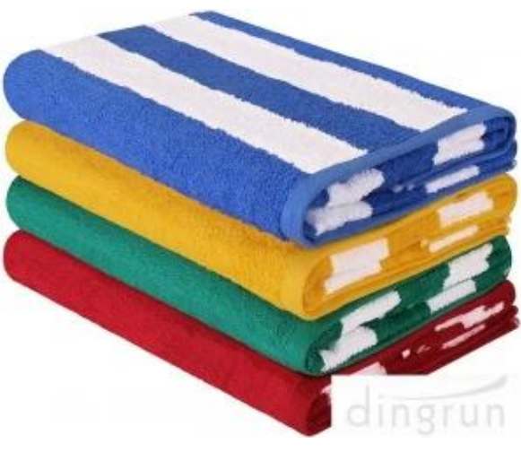
striped towel in wholesales