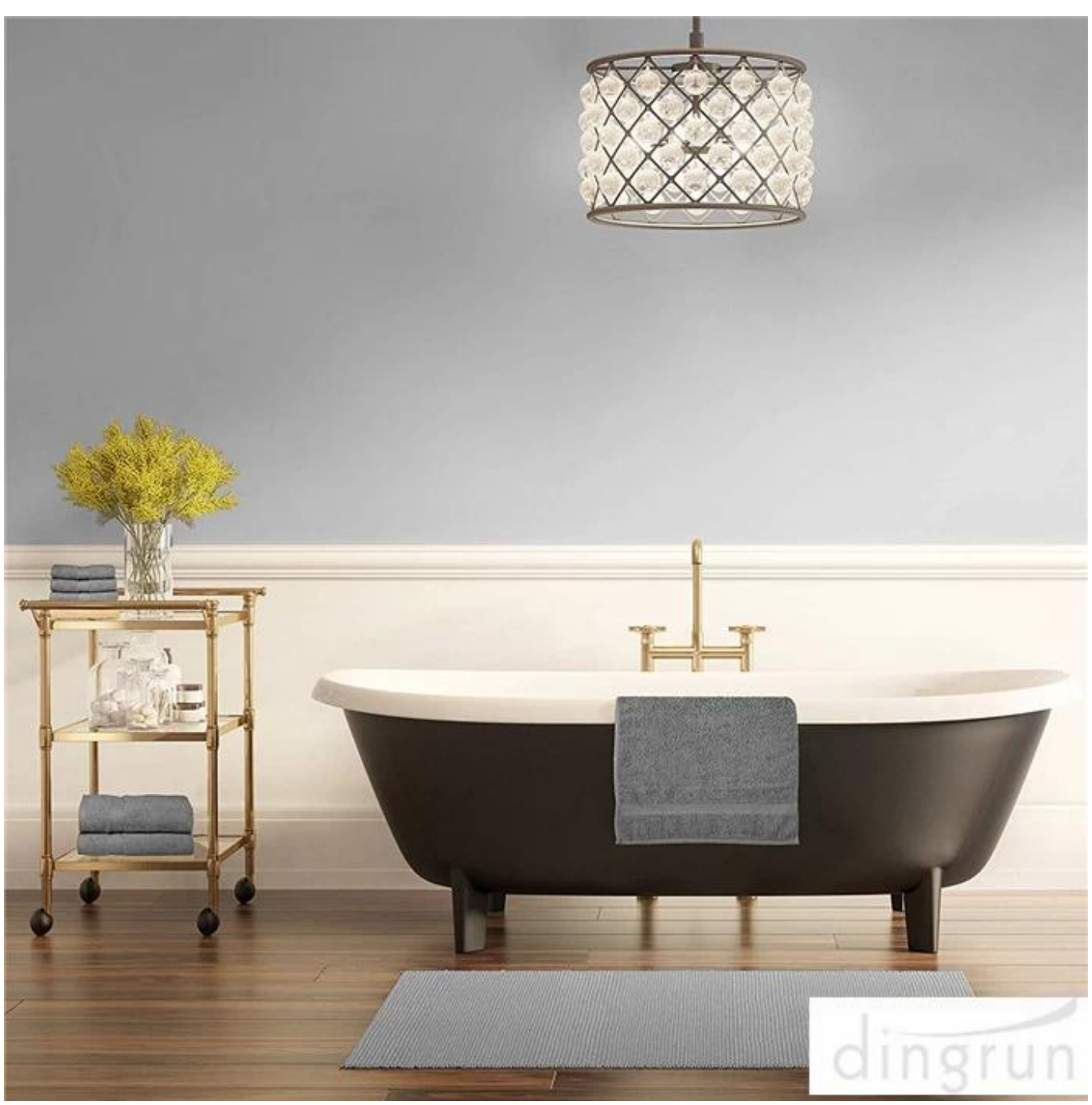
650 GSM ULTRA THICK AND PLUSH FOR A LUXURIOUS FEEL - These lavish hotel style luxury bathroom hand towels with a thickness of 650 GSM - much thicker than most bath towels, feel lovely on your skin and grant a delightful sense of softness and coziness you will revel in.