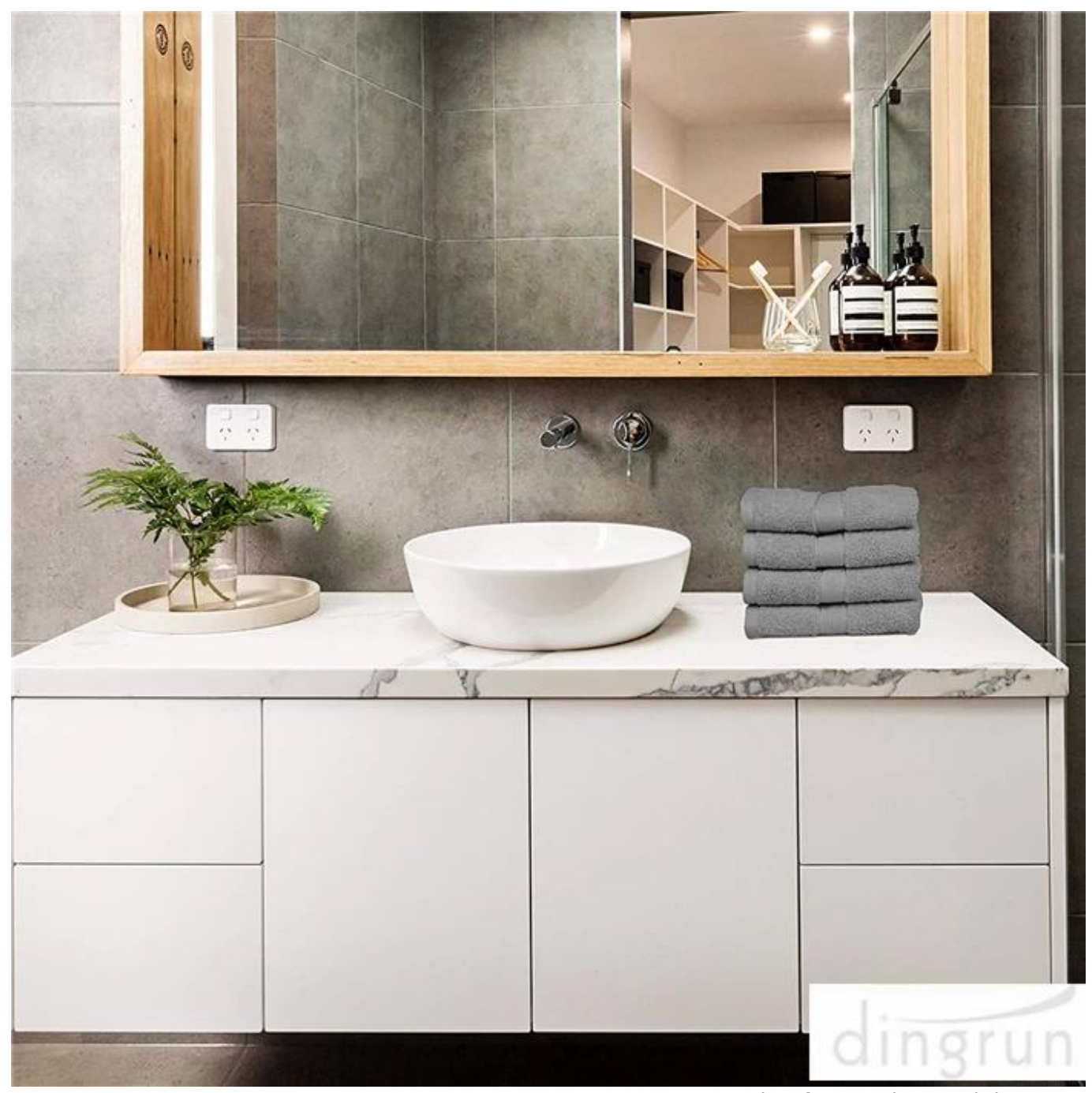
IDEAL EVEN FOR BABIES AND PEOPLE WITH SENSITIVE SKIN - made of natural materials. These cozy towels are the safest choice for people with skin hypersensitivity, as they provide the gentlest care to delicate skin. This bathroom towel set is a great choice for families with young kids too!