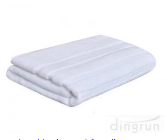
hotel bath towel Supplier