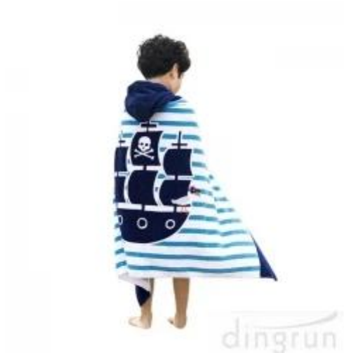
Hooded poncho towel