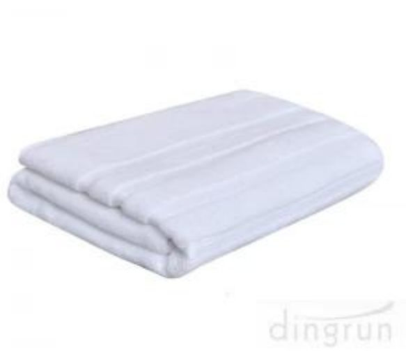
Bathroom towel supplier