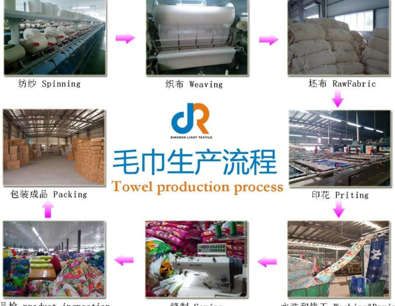
品检 product inspection