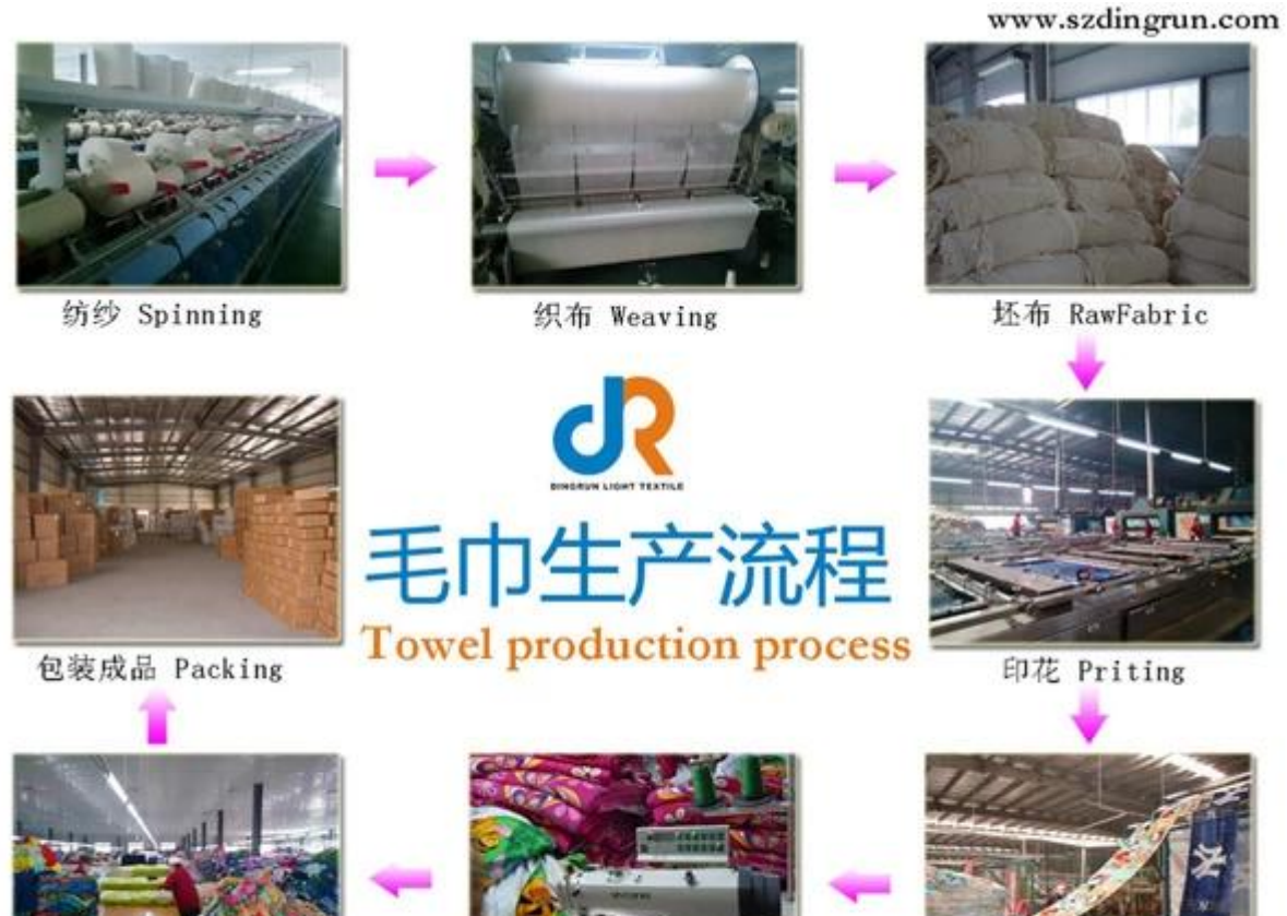
品检 product inspection