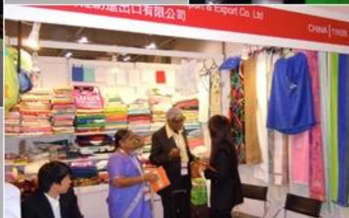
June 19-21, 2012 Miami Houseware Fair, USA