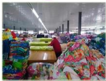
品检 product inspection