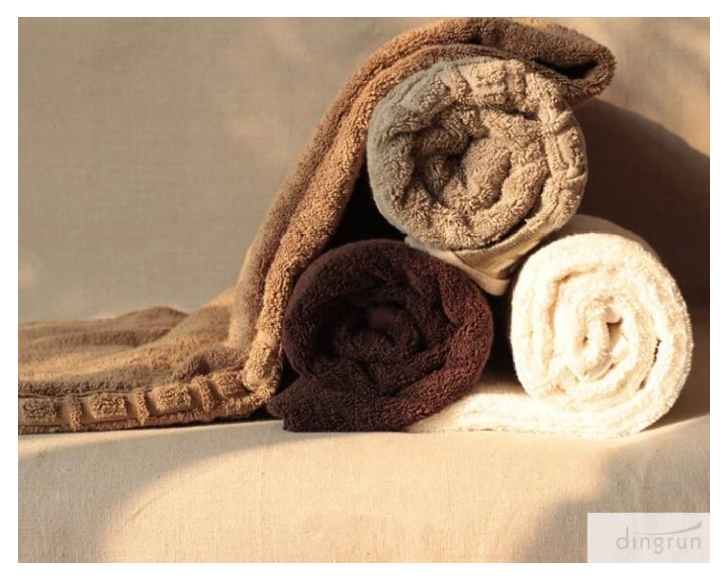
"Luxury" says it all: the thick, oversized towel of 100% cotton terry is constructed of short, densely woven loops of two-ply yarn and weighs in at an exceptional 500 grams per square meter for outstanding absorbency and quick drying.