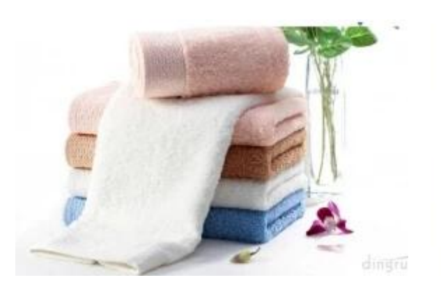
Oversized luxury face towel