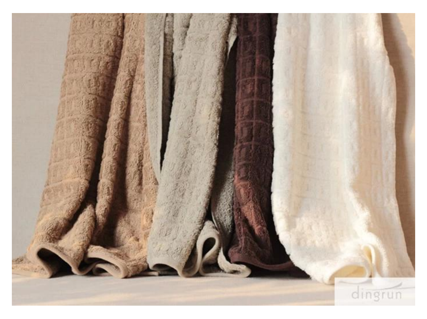
Shop with confidence and trust, we will delight you.