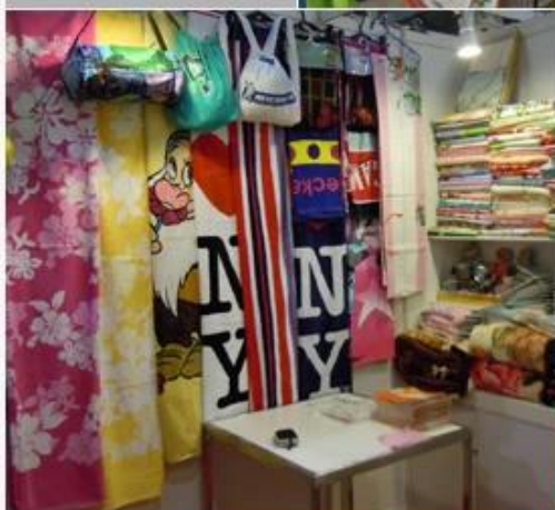
April 19-22, 2011 Hongkong Spring houseware Fair