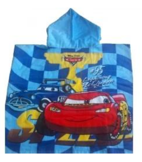
poncho factory for children