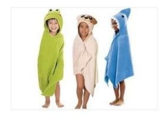
hooded baby towel