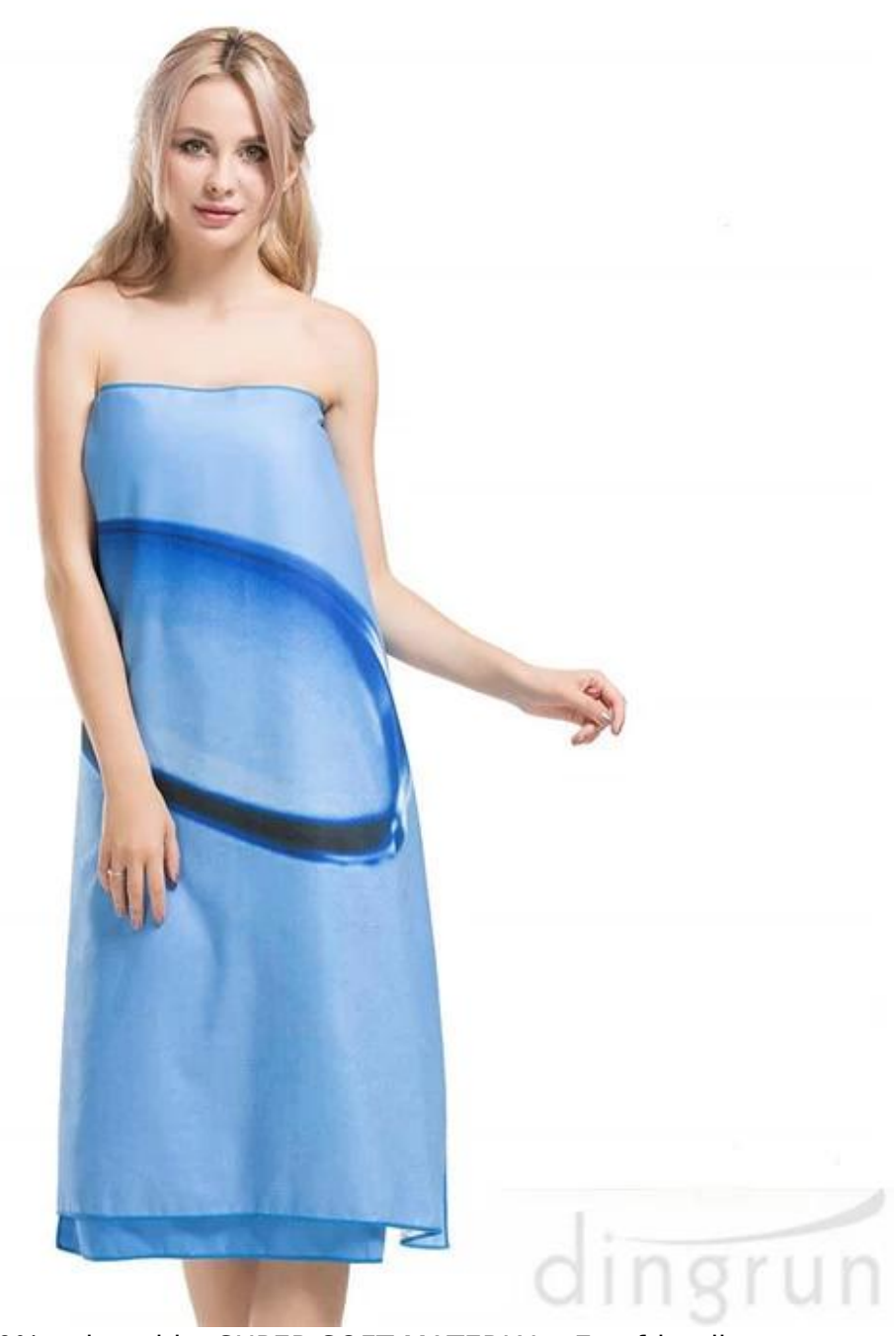
Microfiber:80% polyester and 20% polyamide, SUPER SOFT MATERIAL - Eco-friendly.