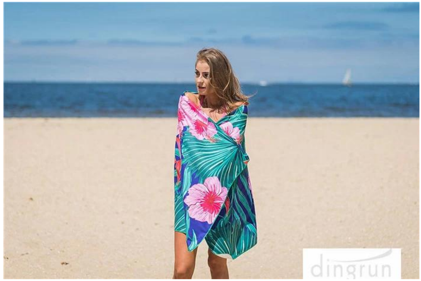
LARGE, LIGHTWEIGHT & COMPACT - The Size of a Standard Beach Towel Only It Easily Folds To a Fraction of the Size and Weight of a Conventional Towel. Size: Large 63x31", Weight:10.06oz OR Size: X-Large 69x39", Weight:12.5oz