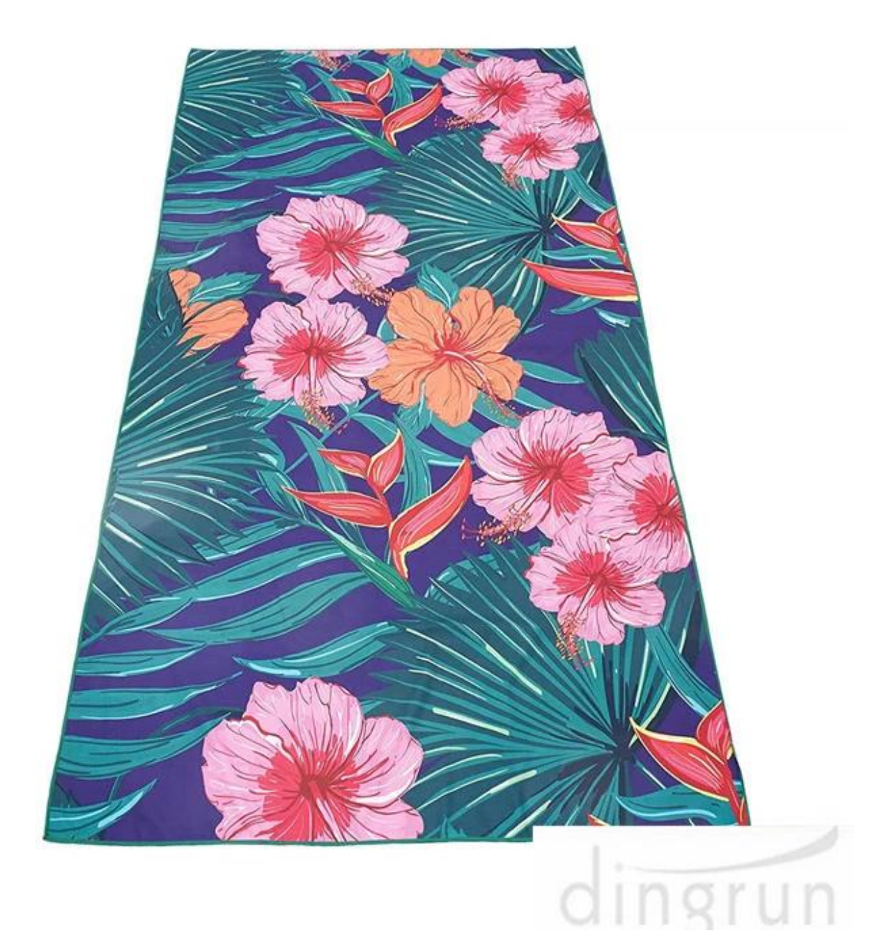
100% MICROFIBER FABRIC - Smooth Microfiber 'Suede' Weave, Soft and Light Weight, Smooth Texture - Not Plush.