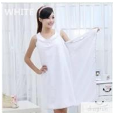
Luxury Bath Towel