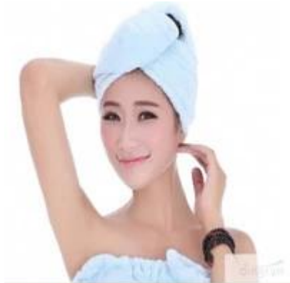
magic hair fast drying towel