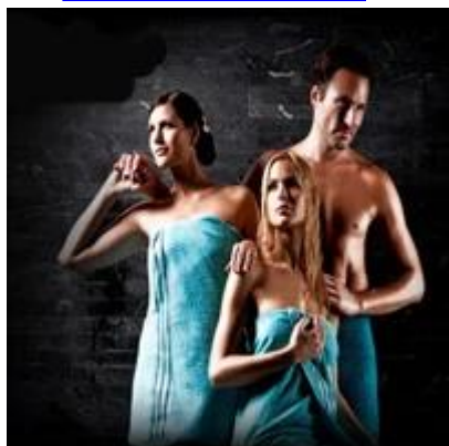
Microfiber Bath Towel